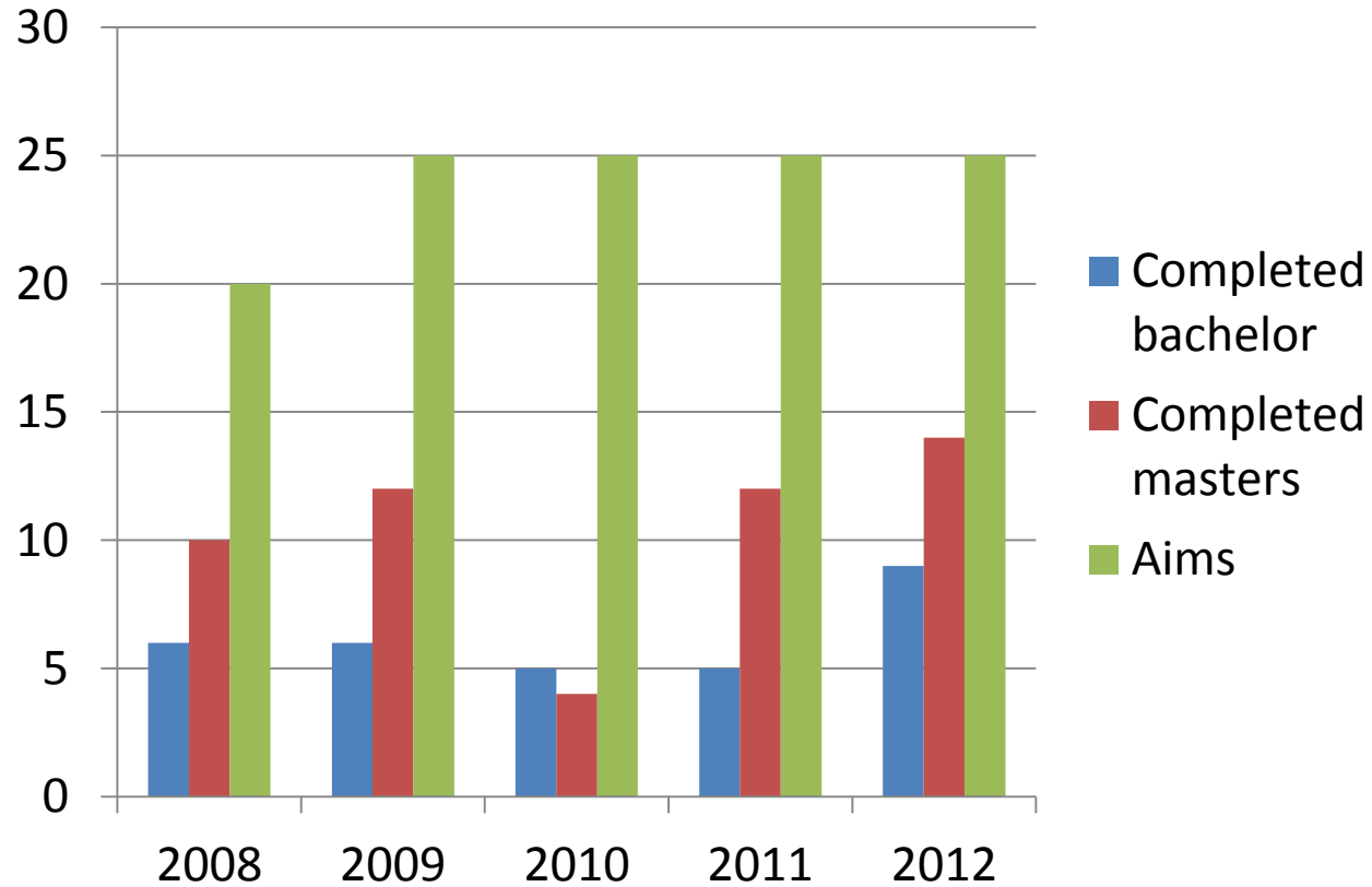
Number of students who have completed bachelor and master in the forest sciences at NMBU 2008- 2012.